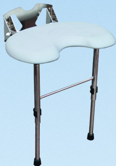
C223 A EVO

The construction and wall mounting part are made of stainless steel, while the seat is made of flexible plastic, which is easily subjected to pressure. The seat can be folded to the wall. The shower seat can be used both at home and in health care units and public institutions.